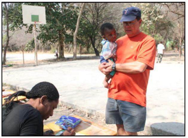
7 month old Mafenyeho also needed help at the finish line

This month our older children – those in grade 8 and above – were living in hostels at their schools. The national school system provides a type of boarding school environment for the older children. There are 19 children from Zion attending these schools and are considered "out schoolers". We still have 27 children currently in residence, which makes for lots of drama!