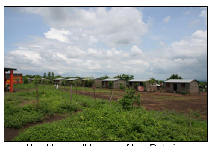
Humble, small homes of Los Rotarios

We have a couple of teams coming to Nicaragua this summer. We'll report to you how they do, trenching in the rain!