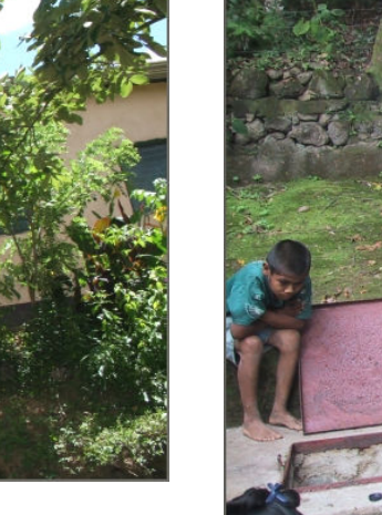
Above – Church on the hill Right – Spring box

Besides visiting future project sites, we also drilled a well this month. We had an emergency call from a community here in Chinandega. It seems the Barrio of La Libertad had their well of 35 years collapse. The neighborhood has more than 350 families who were without water for about 2 weeks. We had to borrow another Amigos drill rig for this well, because the well needed to be drilled to 12" to house an 8" diameter casing. We were learners on this project since we had never used this type of rig. After the well was completed, we had a community celebration to give the glory to God for the well.