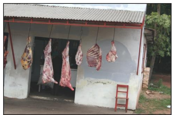
Like the smoky flavor diesel fumes give meat? Just buy from your local meat market.