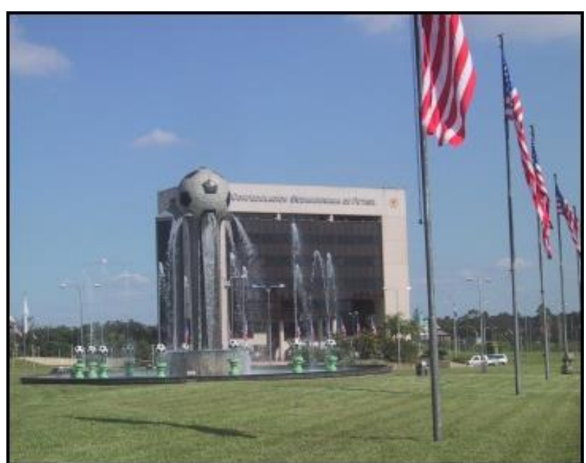
On the left is a statue of the founder of Asuncion. It is located in front of the Paraguayan State House. Above is a photo of the home of the South American Federation of Futbol (soccer).