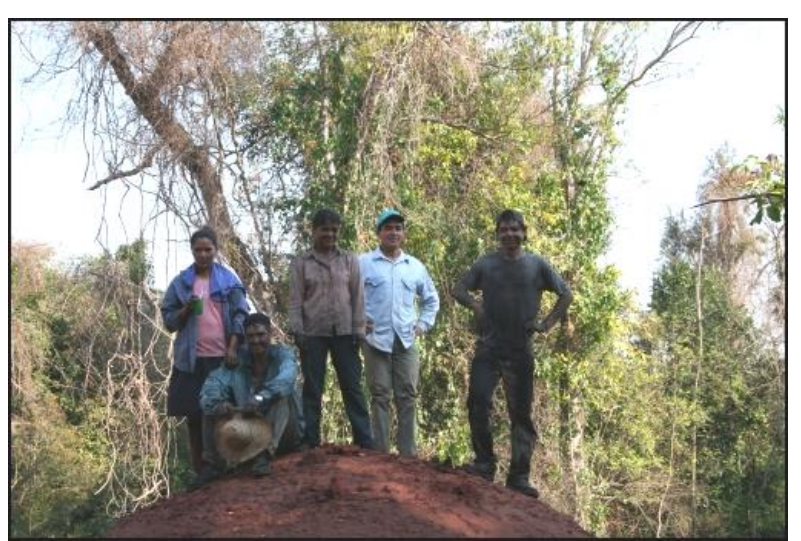
These folks are making carbon. They always remind us of chimney sweepers – covered in soot.