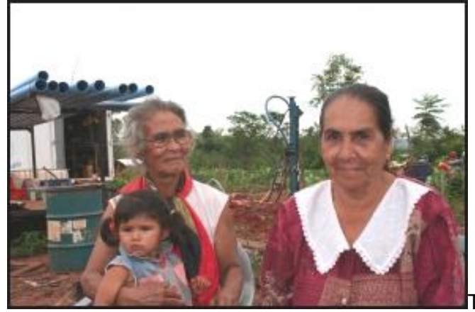
Two sisters/grandmothers waiting for a well

On the right, pigs just love puddles after a good rain, we just have to be very careful driving through all those puddles! Doesn't he look like he's smiling?