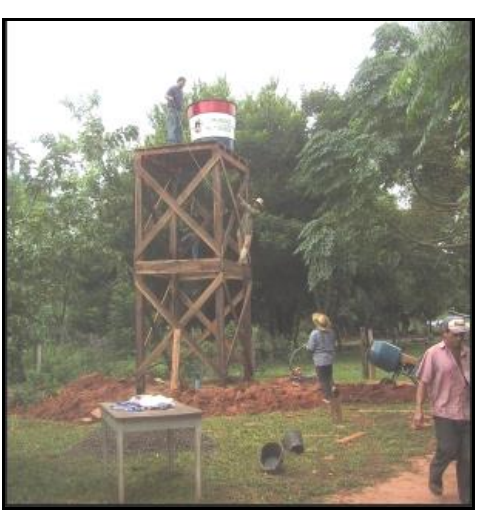
New tower and tank