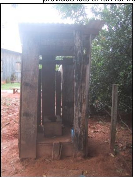
This is a photo of the old out house. Do you see what's missing? Yes, no door! When you use the bathroom, you need to decide – face forward or backward. Which way would you face?