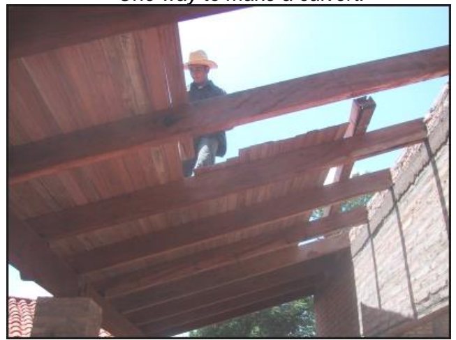
Putting up tongue & groove ceiling on Susannah Wesley School