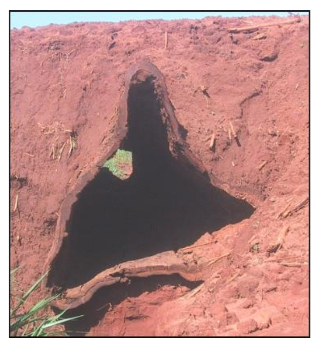
One way to make a culvert!