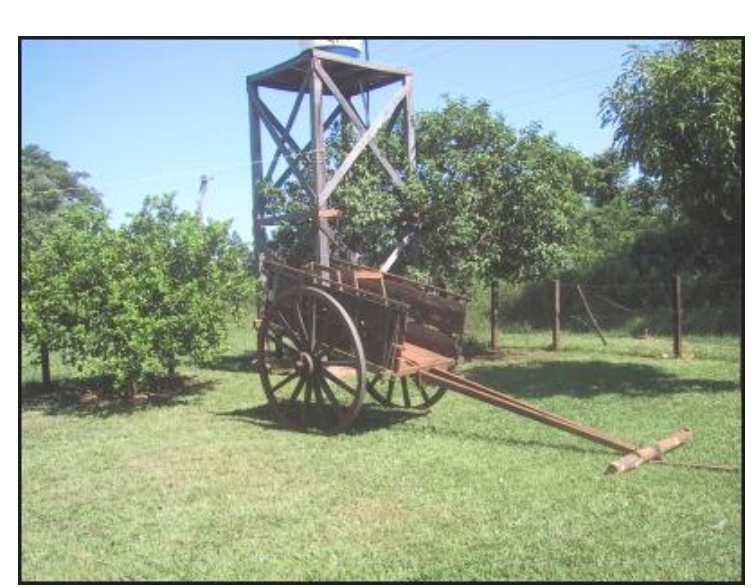
Ox cart in front of well tower at Ara Pyahú

We thought we would share a few street scenes with you this month. Enjoy the photos we have selected! Oh yea, we still have temperatures over 100 daily – can't wait for fall!