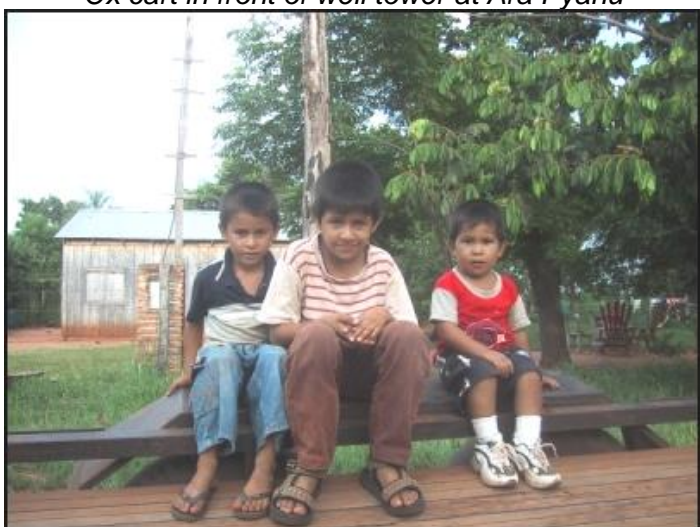
3 cute boys at Sanginacue