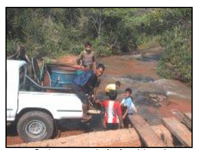
Getting water can be fun for adults too!

The second week we drilled the well at the Reservation. The well drilled to 42 meters (138.6'). We have so many good pictures from this project; we just don't know where to begin. Here are some (we added a new section to the web site with more pictures of the Reservation):