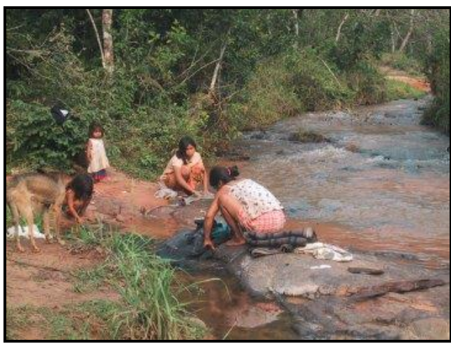
While at the creek, these ladies were doing their laundry