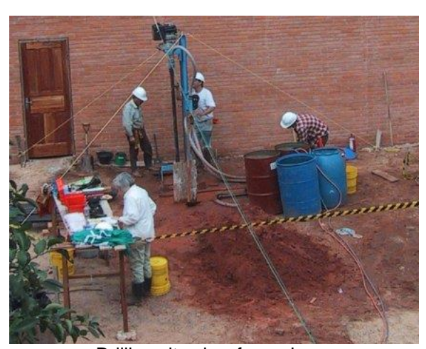
Drilling site view from above

Our schedule is to finish this well in Lambare, and then move into the interior. We hope to finish at least 2 wells before leaving for Christmas vacation on December 16<sup>th</sup>. Please pray for our safety and the advancement of our Lord's kingdom. Our minds and hearts have a 110% commitment to our ministry – but our bodies are lagging a bit behind! By our next report, we hope to be in better physical shape and be able to enjoy our work to a greater degree.