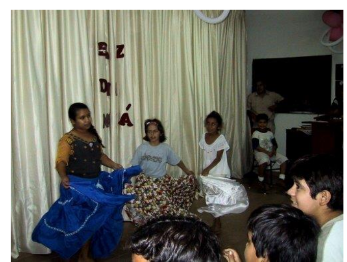
Dancers from Mother's Day celebration