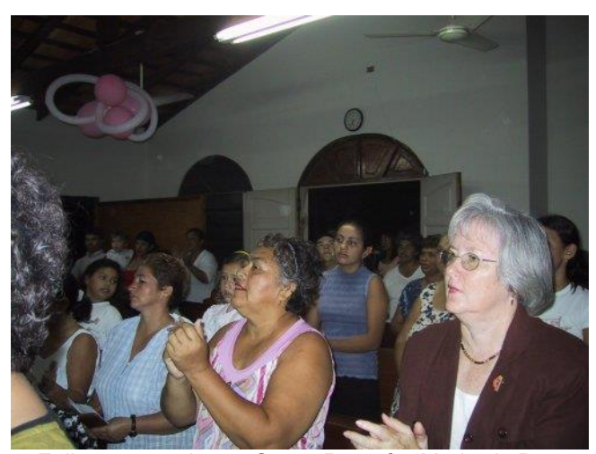
Full congregation at Santa Rosa for Mother's Day