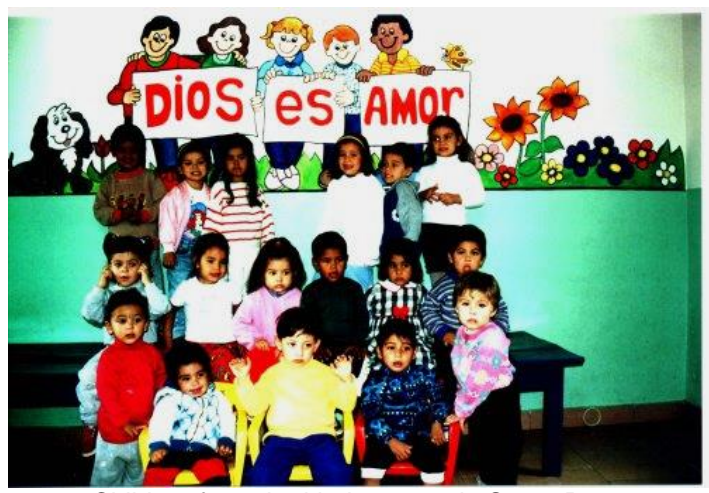
Children from the kindergarten in Santa Rosa