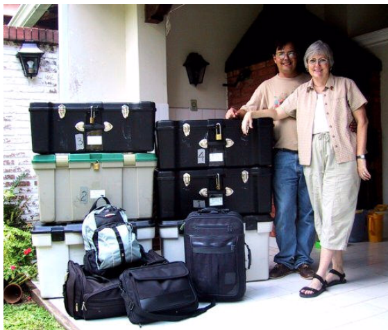
Everything for a 4 year term!

Well – we made it to Paraguay – the path that God put us on two years ago has finally gotten us to the field!! His love and faithfulness never cease to amaze us. We got here without any problems, as did our 6 trunks and carry-on luggage – praise God! It was a challenge to decide how to limit ourselves to only 6 trunks for a 4 year term, but we managed. We will be back to the US in about a year, so we can bring anything we really miss then.