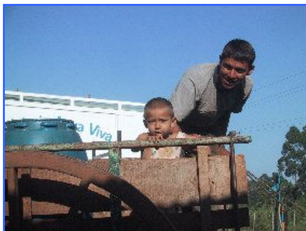
This man & his son came to the church at Arapyahu via ox cart to get some water, his well is currently dry.