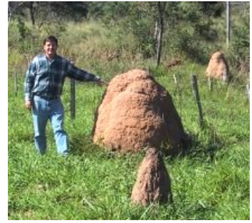
HUGE ant hills in the Chaco!