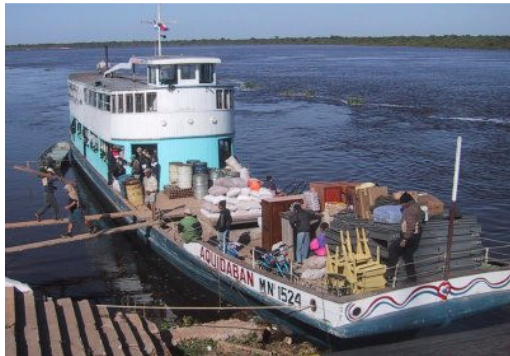
Riverboat on the Paraguay River

Santaní and then on home to Asunción. Concepción and Santaní are both towns where we may live when we get our water well ministry going.