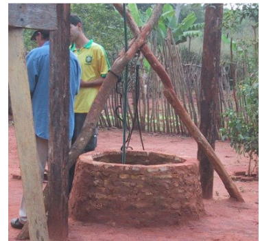
Current well at Qunita Linea

Our next adventure was to deliver a motorcycle which we had bought (see "Motos para Jesus") for a pastor in the "interior". Since this is the first region where we will drill wells the trip served also as a fact finding mission. Our first well will probably be at a small church and school at a settlement called Quinta Linea in a region called Yrybucua. It is about 2 hours off the paved road (in good weather) on some of the worst dirt roads we have ever seen, but it is a spiritual oasis bustling with activity. The church is a small wooden building harking back to the old country church of the 1900s in the US. Pastor Felix is a wonderful man who lives in a small parsonage next to the church with an