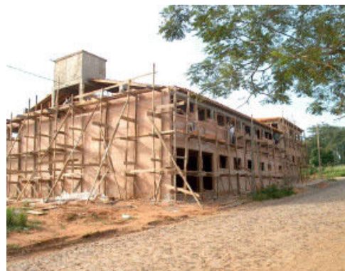
Methodist school under construction