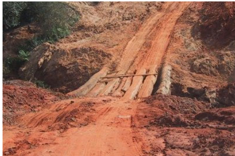
Log bridge in the Yrybucua region

extended family of 12 people. Also located on the property is a Methodist School which has 75 kids in attendance. The two teachers also live on the grounds in a small duplex. With all of this activity, they need a lot of water. They have a hand dug well, but the soil is very sandy and the water table is over 40 feet deep. The first well collapsed, and the second well is not deep enough to produce sufficient water for all of the activities. Please keep this congregation in your prayers as we plan to bring them much need water.