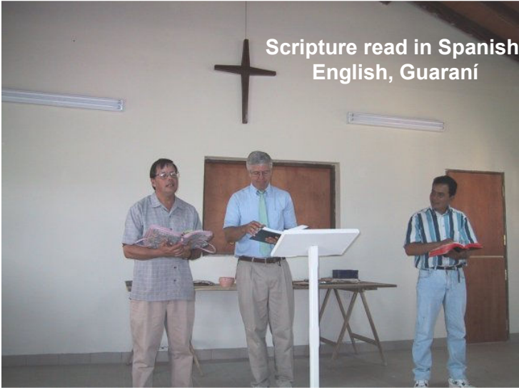
Scripture read in Spanish, English, Guaraní