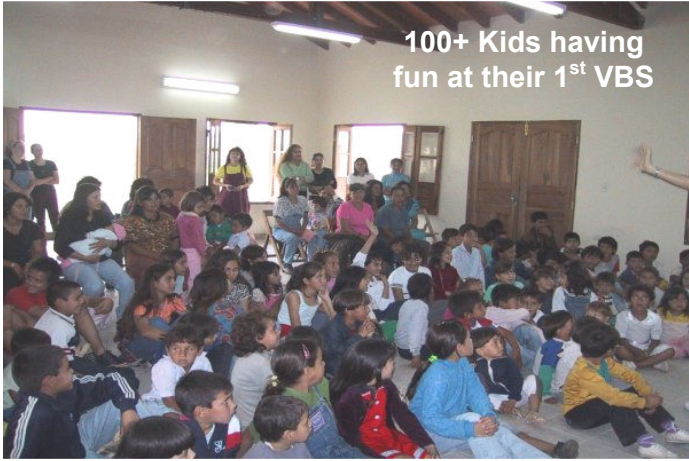
100+ Kids having fun at their 1 st VBS